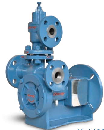
Model RC40 with Bypass Valve